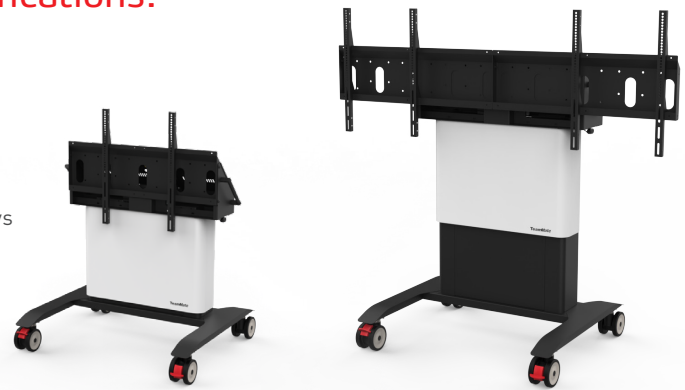
Single screen mount