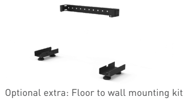
Optional extra: Floor to wall mounting kit