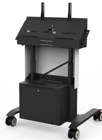
Optional extra: 8U 19" rack extension module