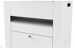
Optional storage shelf