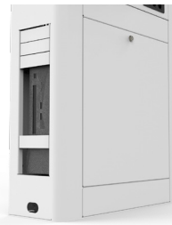
Compact or tower pc compatible