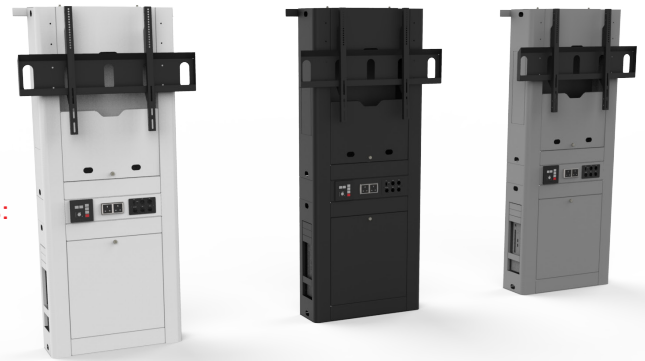
Totem finished in standard white with custom black and silver powdercoat