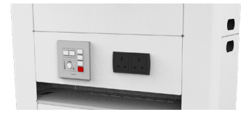
Custom interface panel with cut out for control panel/ power/input plate