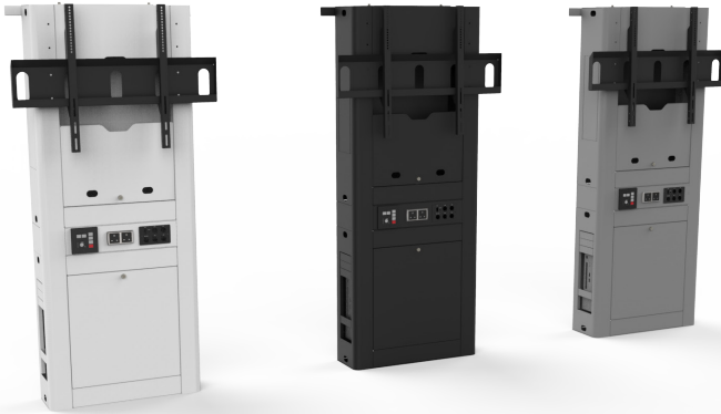
Totem finished in standard white with custom black and silver powdercoat