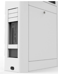
Compact or tower pc compatible