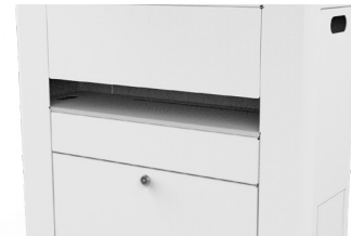
Optional storage shelf